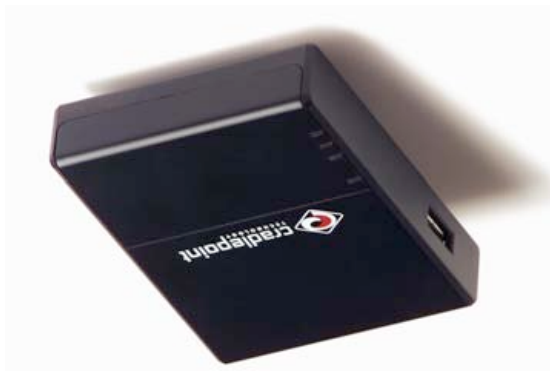
Cradlepoint CTR-350 Cellular Travel Router