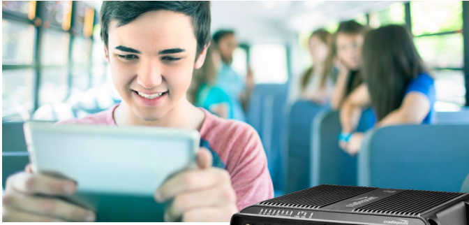
Cradlepoint NetCloud for IBR1700

Provide Internet access to at-home students by installing connectivity in school buses to be parked in the community