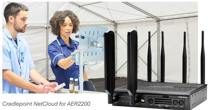
Cradlepoint NetCloud for AER2200

Establish a network in minutes at temporary or popup locations