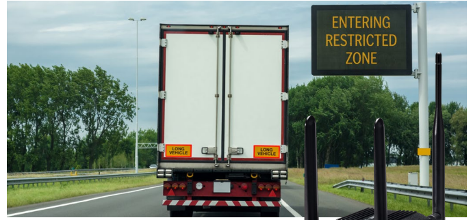
Cradlepoint NetCloud for IBR200

Keep community and facilities safe by using digital signage and security cameras